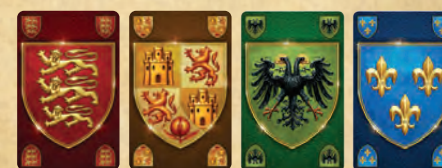
102 Country Cards