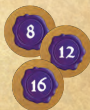
3 Noble House Markers