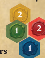
16 City Bonus Markers