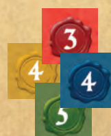
24 Period Scoring Markers