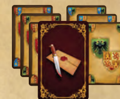
24 Intrigue Cards