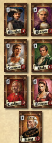
Title Scoring Markers