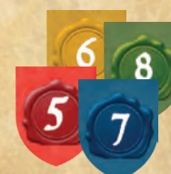
8 Country Bonus Markers